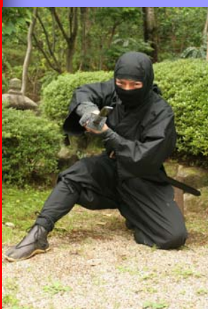
A ninja character at Nikko Edo Village

The World Heritage Pass is the most popular of the discount passes.