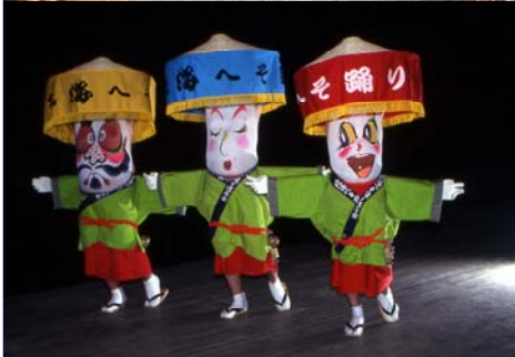
From top: Sumiyoshi Festival, Gujo Odori Festival, Furano Bellybutton Festival.