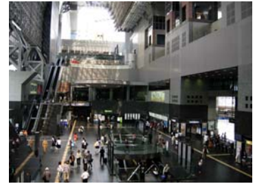
Kyoto Station

- From July 1, JR West will make the interior of all its stations in the Kyoto, Osaka and Kobe area completely non-smoking.