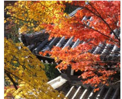
Yoshiminedera in autumn

Saikoku 33 Temple Pilgrimage www.saikoku33.gr.jp (Japanese only)