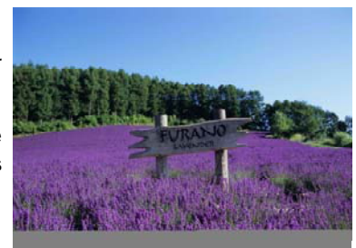
Lavender field in Furano

Check the Travel Info section on JR Hokkaido's website for more Hokkaido summer news and special summer train timetables.