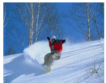
Boarding at Niigata Prefecture's Myoko-Kogen