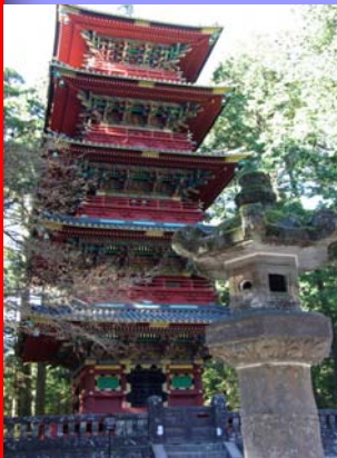
Nikko Toshogu's five storey pagoda

Additionally, the Tobu Sightseeing Service Centre located inside Tobu Asakusa Station has English speaking staff on hand to assist international visitors with tourist information.