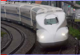
Nozomi N700 shinkansen