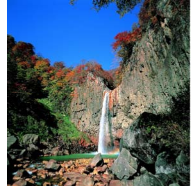
Located 15 minutes by car from Myoko Kogen Station on JR East's Shin'etsu Line is Niigata Prefecture's Naena Waterfall. The autumn foliage at the waterfall is spectacular in October and November.

*No youth rate is available. Child rate is for children aged six to eleven years. Children 12 years and above travel on adult rate. Children under six travel free, except when a reserved seat is used by a child, then the child must travel on the child -rate pass.