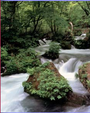
Oirase River has 15 small and large waterfalls and is popular for its beautiful mountain stream.

Hoshino Resort's Hoshinoya Karuizawa is the first property in Japan to become part of the Small Luxury Hotels of the World brand.