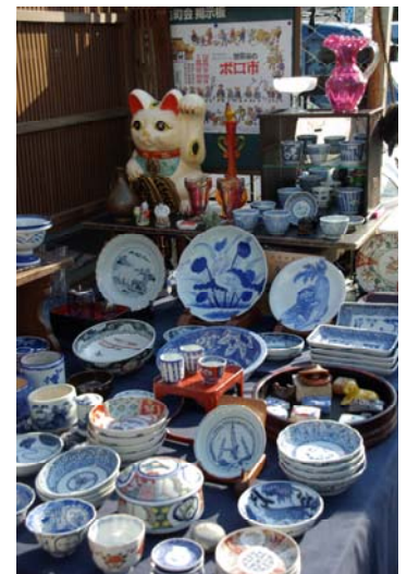
A stall at one of Tokyo's many flea markets.

The market articulates over 400 years of Edo (today's Tokyo) in antiques displayed by dealers.