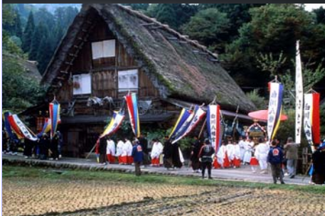
Kurama Fire Festival; Doburoku Festival.