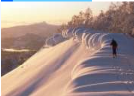
Japan's perfect powder

As part of the Visit Japan Campaign (VJC) in Australia, JNTO and the VJC Committee held a ski promotion seminar and reception at the Sydney Hilton for Sydney ski/travel agents and media on 5 June 2006.