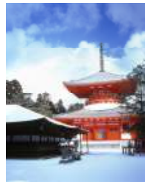
Konpon-dai-to, Mt Koya

For more about Mt Koya please visit www.shukubo.jp/eng/index.html