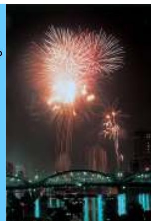
Sumida River Fireworks

Tokyo's largest fireworks display with more than 20,000 fireworks set off.